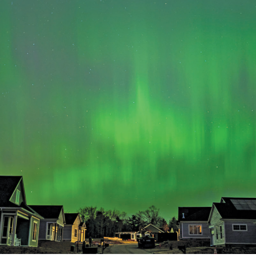
"The Night Sky" on Jasper Drive.