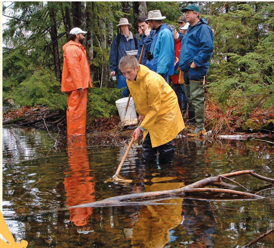
The Ecology Center is located on Highland Green's 230-acre nature preserve.