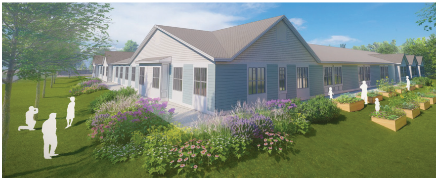
The new 17,000 SF Tedford Housing emergency housing building will include both family shelter and adult shelter facilities and will serve approximately 40 towns in Maine