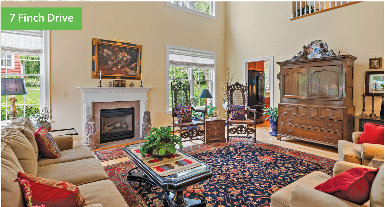
The meticulously maintained home available for resale at 7 Finch Drive features many comfortable rooms for relaxing including the screened-in porch, which abuts the Heath Nature Preserve.