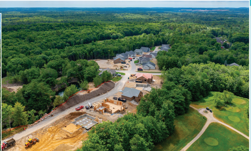
The new neighborhood in the Quarry Phase 1 at Highland Green is taking shape. Prime homes sites for new construction remain available on Jasper and Diamond Drive.