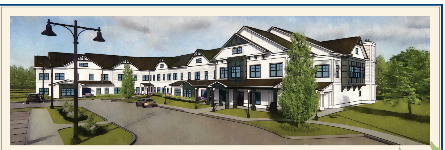
Assisted Living and Memory Care will be a new addition to the Highland Green campus, providing seamless access to a valuable extension of support services.

Put Your Move in Motion. Call 1-866-854-1200 today to plan your future.