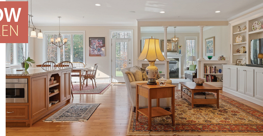
7 Sugar Maple Drive abuts the Heath Preserve.

The open kitchen and great room feature a large granite kitchen island and counters with white Glenwood cabinets. The kitchen has 6' windows and appliances are chef grade and include a gas 6 top Wolf range, Samsung 4-door