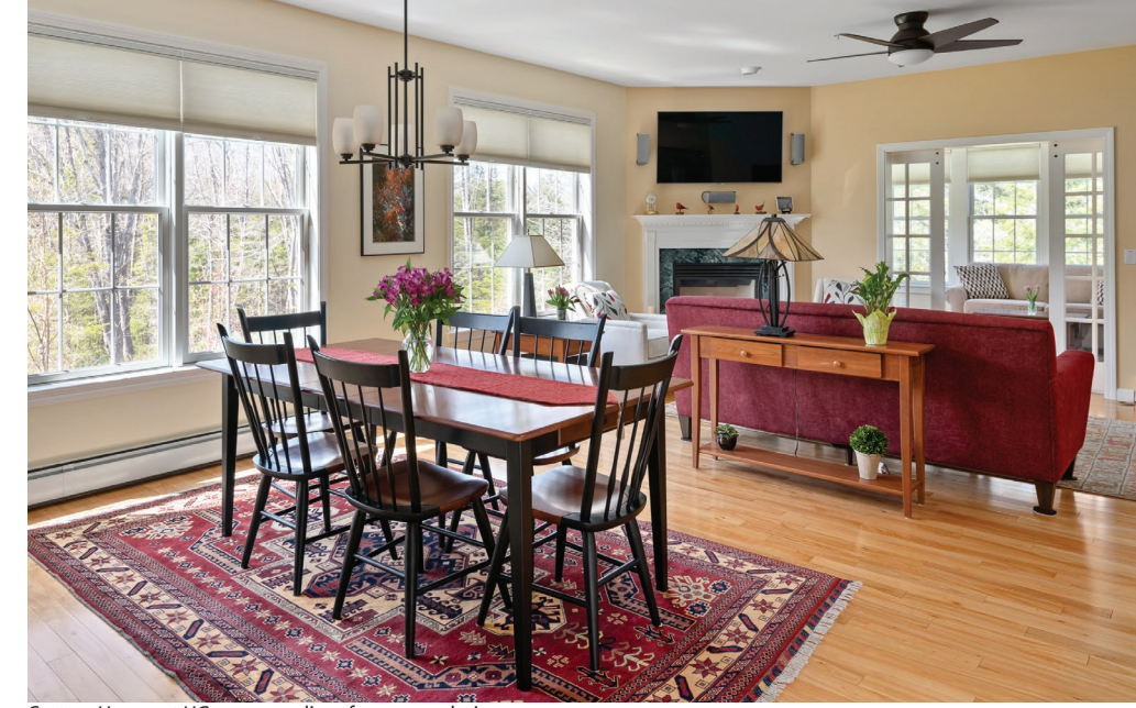
Custom Homes at HG are a paradise of your own design

Custom Homes at Highland Green are a blank canvas ripe for filling with color, warmth, light and life...all to create a paradise of your own design. While they last, select lots are now available for custom building on elevated home sites abutting the picturesque Cathance River Preserve here at Highland Green. But don't delay. To make your move before 2022, you need to set your sights on a site now. Having designed and built more than 200 homes from the ground up, we have a deep inventory of existing plans that you can either replicate or modify.