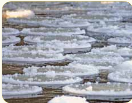
"Pancake Ice" on the Cathance River on the Preserve at Highland Green