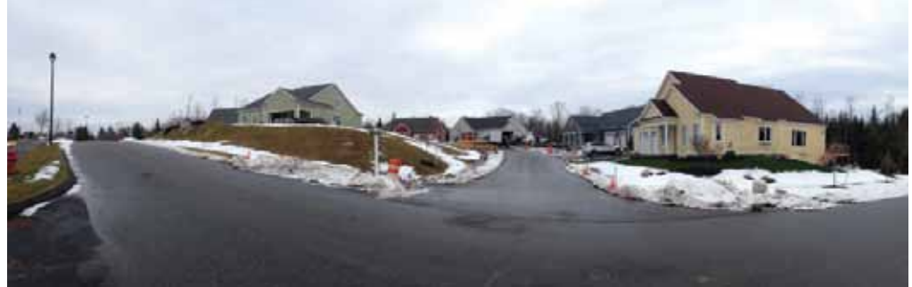
Top: Red Maple Lane in January 2014; Bottom: Red Maple Lane nearly complete in December 2014

January and into February of 2015, activity has not missed a beat at Highland Green. Through more snow in two months than sometimes occurs in an entire winter, custom home construction continued, new friends moved into already built resale homes, new acquaintances visited, and Highland Green residents remained busy. The vast majority of people who live here do so year-round because they love Maine, Highland Green, and the four seasons .