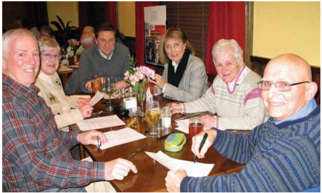
Team “Wobby Warblers” at a recent Wild Duck Pub Trivia Night

Those Highland Green residents who are “snow-birds” or who simply like to take a winter vacation can enjoy “turnkey” living and leave without worrying about their houses. Highland Green homes are equipped