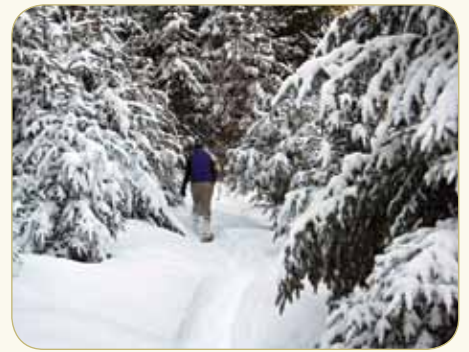
Snowshoeing on the Barnes Leap Trail at Highland Green