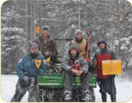
A Highland Green shoveling crew