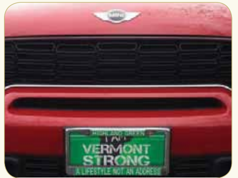
The Hughes' license plate (see back cover)