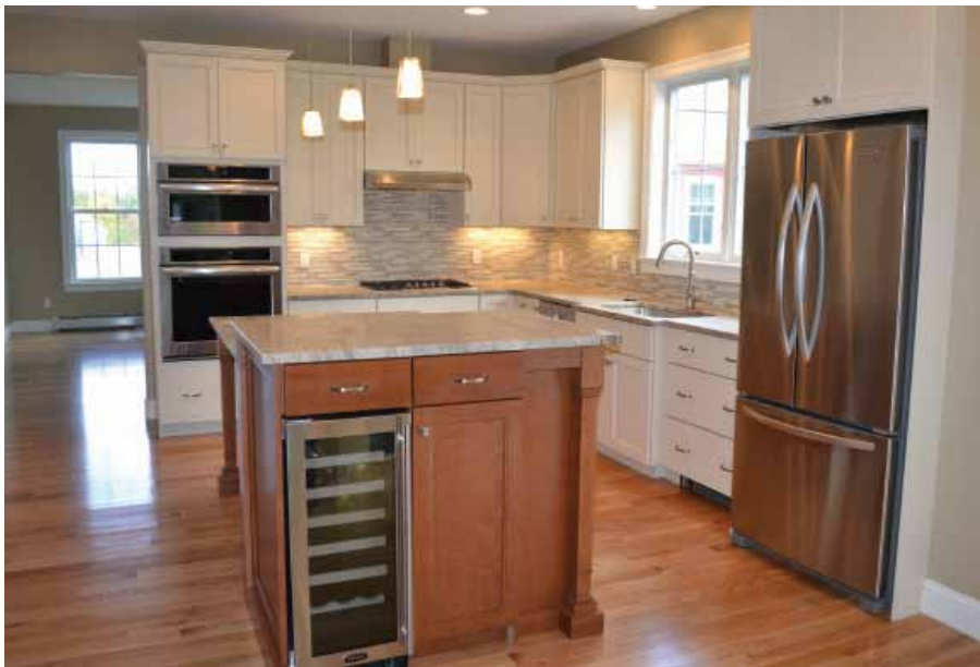
Ed and Linda’s new custom kitchen at Highland Green