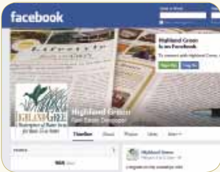
Highland Green's Facebook Page has over 900 LIKES