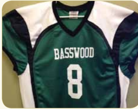
A special edition football jersey commemorating the beginning of the "Basswood" neighborhood