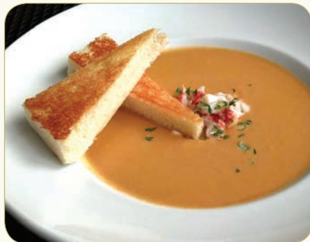
Chef prepared Maine Lobster Bisque with Toast Points at the Wild Duck Pub at Highland Green