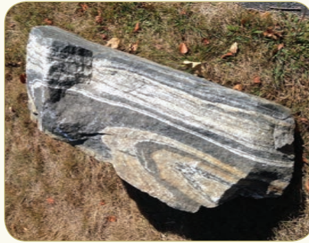
One of Highland Green's signature volcanic rocks is bound for the Maine Gem and Mineral Museum