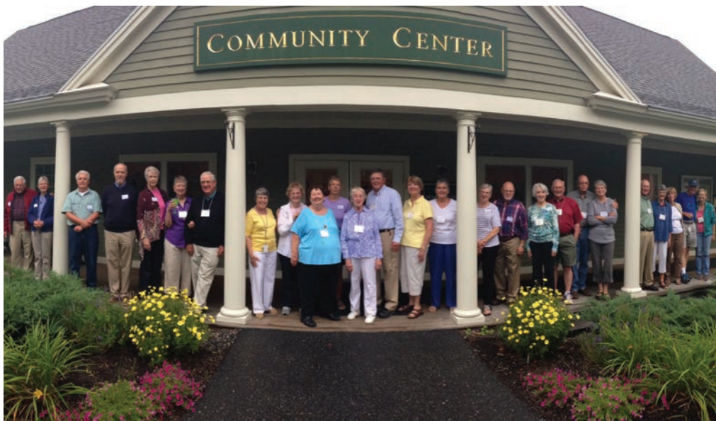
A Highland Green North Phase III neighborhood “block party” at the Community Center