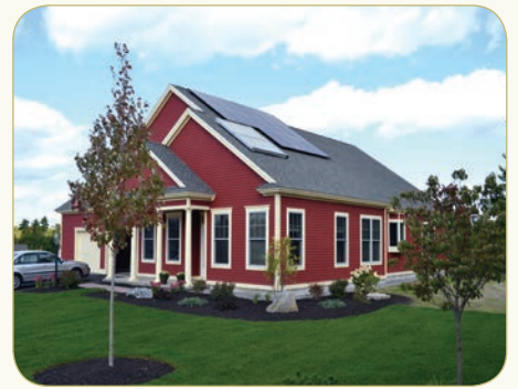
Solar Energy is a popular option for Highland Green's custom built homes