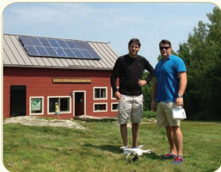
Highland Green's video team at the Ecology Center readies the aerial drone camera for spectacular footage now available on our YouTube page