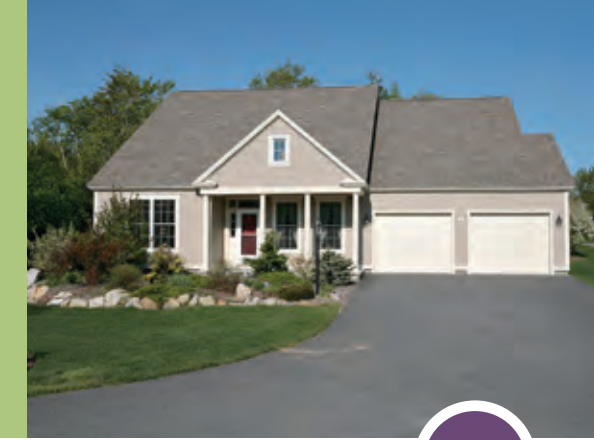
1 Kingfisher Drive at Highland Green

Has your current home sold quickly? Would you like to experience life at Highland Green before you even move in, while you watch the construction of your new Highland Green home and your dreams come to life? Simply take advantage of the Highland Green Rent While You Build Program! Our team of helpful, knowledgeable marketing professionals can help new construction buyers smoothly transition from their current living situation with convenient rental options. For more information, including home rental availability and specifications, visit highlandgreenlifestyle.com.