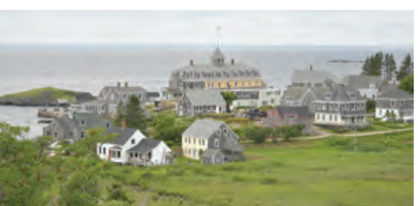
The village of Monhegan Island

The Quarry Cottage Expansion Phase is progressing nicely, with the construction of several homes in progress and even more sales in queue. As the real estate market establishes some semblance of equilibrium, our homes for resale inventory continues to increase as well, creating viable living options for those who need or want an immediate seamless transition into a Highland Green home. There has also been a remarkable amount of interest in our luxury apartment sales and rentals, as well as key assisted living and memory care services.