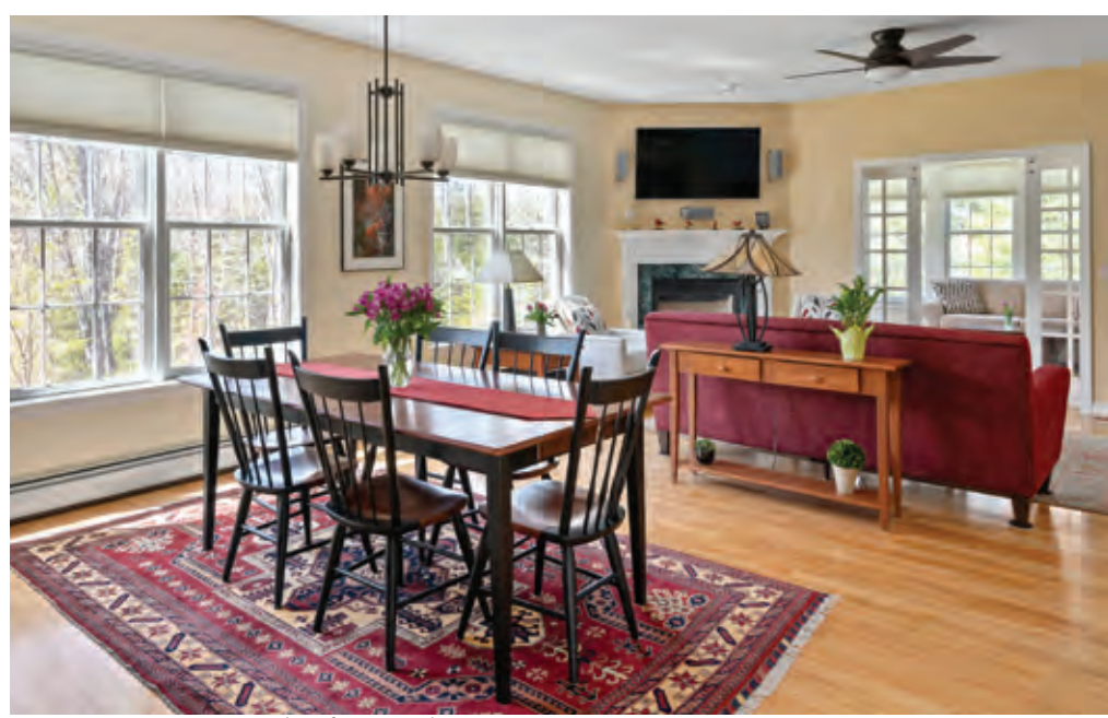
Custom Homes at HG are a paradise of your own design.

Custom Homes at Highland Green are a blank canvas ripe for filling with color, warmth, light and life...all to create a paradise of your own design. While they last, select lots are now available for custom building on elevated home sites abutting the picturesque Cathance River Preserve here at Highland Green. But don't delay. To make your move before 2023, you need to set your sights on a site now. Having designed and built more than 200 homes from the ground up, we have a deep inventory of existing plans that you can either replicate or modify.