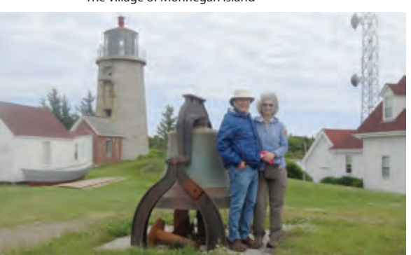
Highland Green residents enjoying Monhegan Island