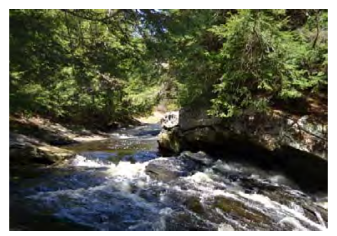
The spectacular Cathance River flows past miles of trails on The Preserve at Highland Green