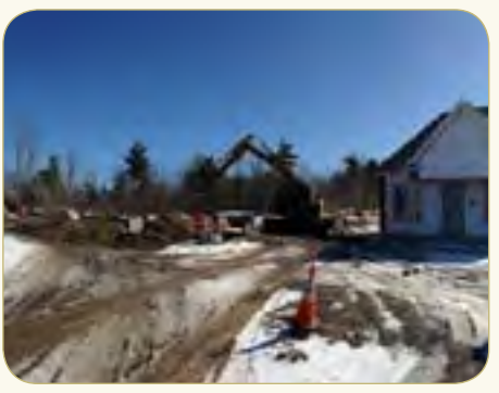
Lots of new Highland Green friends' homes being built