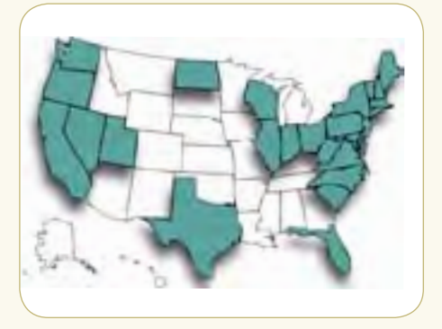
Residents from 27 states and counting...