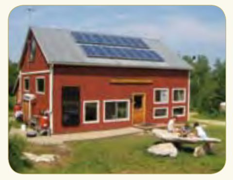
The Cathance River Ecology Center at Highland Green: The Building that Teaches