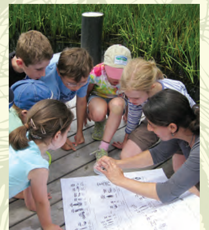
Environmental Learning in Action