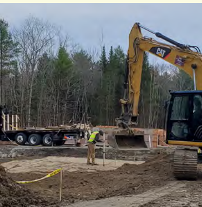
Foundations are being poured on Jasper Drive for custom homes and Quarry Cottages.

Whichever style you prefer, Diamond Drive homes are available on a first come, first served basis. Reserve your spot as soon as possible so you don't miss out on this limited opportunity.