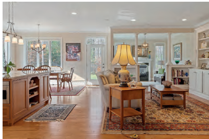
Custom Homes at HG are a paradise of your own design.

Custom Homes at Highland Green are a blank canvas ripe for filling with color, warmth, light and life...all to create a paradise of your own design. While they last, select lots are now available for custom building on elevated home sites abutting the picturesque Cathance River Preserve here at Highland Green. But don't delay. To make your move before 2023, you need to set your sights on a site now. Having designed and built more than 200 homes from the ground up, we have a deep inventory of existing plans that you can either replicate or modify.