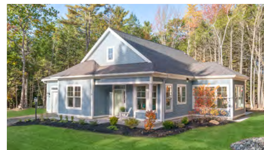
The cottage at 9 Sparrow Drive is currently available as part of the Rent While You Build Program.

Highland Green's Rent While You Build Program has been such a success that we are adding another lovely residence to our rental portfolio in an effort to accommodate the surge in requests to participate. The increased interest in this program is certainly understandable. Imagine your new home is being built at Highland Green and your home sells quickly. The Highland Green Rent While You Build option provides an interim step allowing new construction buyers to smoothly transition into Highland Green. For more information, contact our team of helpful, knowledgeable marketing professionals at 207-725-4549 to learn more. You can also visit highlandgreenlifestyle.com for home rental availability and specifications.