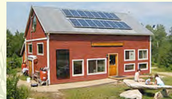
Ecology Center at Highland Green

On December 22nd, Forest Play Group is back with a reading of Snow Birds by Kristen Hall, participants will also be creating their own binoculars and winter bird watching. Stay tuned for details on more upcoming CREA events and adventures!