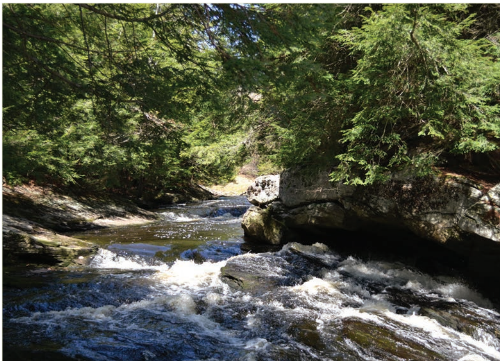
The Cathance River on the Preserve at Highland Green

At Highland Green, BTLT primarily provides management of the extensive trail system and counts many Highland Green residents as members. They also provide volunteer trail maintenance and monitoring opportunities for those Highland Green residents so inclined. Many signed up for a BTLT volunteer monitoring workshop in April.