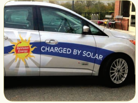
Highland Green is proud solar partners with Revision Energy