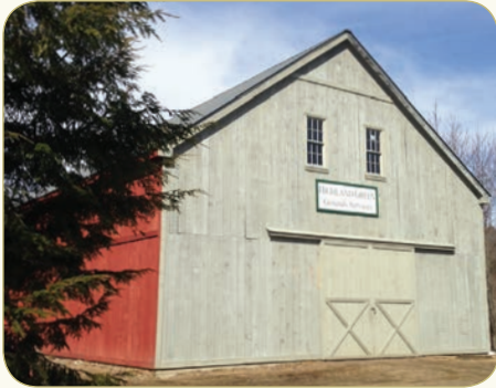
Highland Green Grounds Services Barn