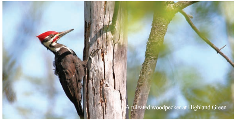
A pileated woodpecker at Highland Green