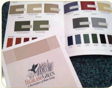
Highland Green's newly enhanced signature color palette by Sherwin Williams