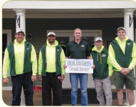
Highland Green Grounds Services crew